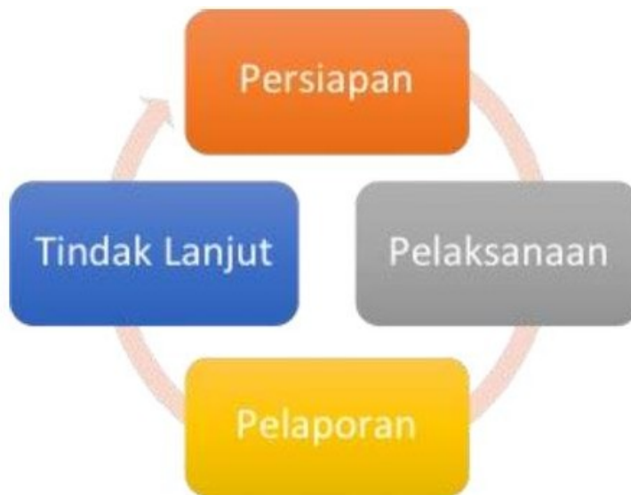
Figure 8.1. International Class monitoring and evaluation cycle

(4) Follow-up Stage , improving the quality of the IC program and socializing the performance results of the International Class Program. In summary, the monitoring and evaluation stages can be described as Figure 7.1.