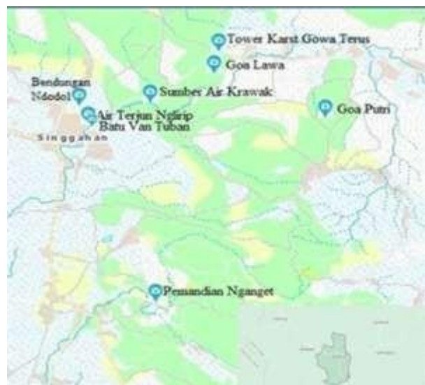
Figure 1 Location of the Social Sciences outdoor learning laboratory in Singgahan District, Tuban

This research is descriptive quantitative through direct field observations, Forum Group Discussion (FGD) activities, questionnaires, and documentation. The research was conducted in the Geopark Karst area, Singgahan-Tuban District as an area of the Social Sciences outdoor learning laboratory. The research subjects were 40 teachers who were members of the Social Science MGMP in Bojonegoro and Tuban Regencies. A total of 40 social science teachers have visited locations that become social science outdoor learning laboratories so that they can assess or provide reviews about the conditions of these locations. The primary data sought is about the actual conditions at the location such as object attraction, infrastructure, human resources, promotions, ticket prices, accessibility. The secondary data sought is about accessibility data and data on supporting facilities around the location. The locations for outdoor learning activities are 1) Nglirip waterfall, Batu Van Tuban, Mbah Jabar's tomb, Mbah Ganyong's tomb (one complex), 2) Krawak water source, 3) Ndadol dam, 4) Nganget baths, 5) Lowo Cave, 6) Karts tower Goa terus, 7) Putri cave.