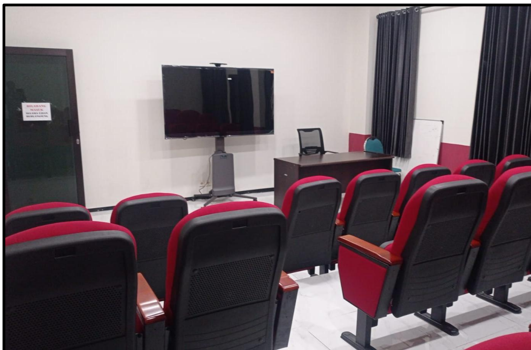
Picture 2. Smart Classroom/Theater Seat