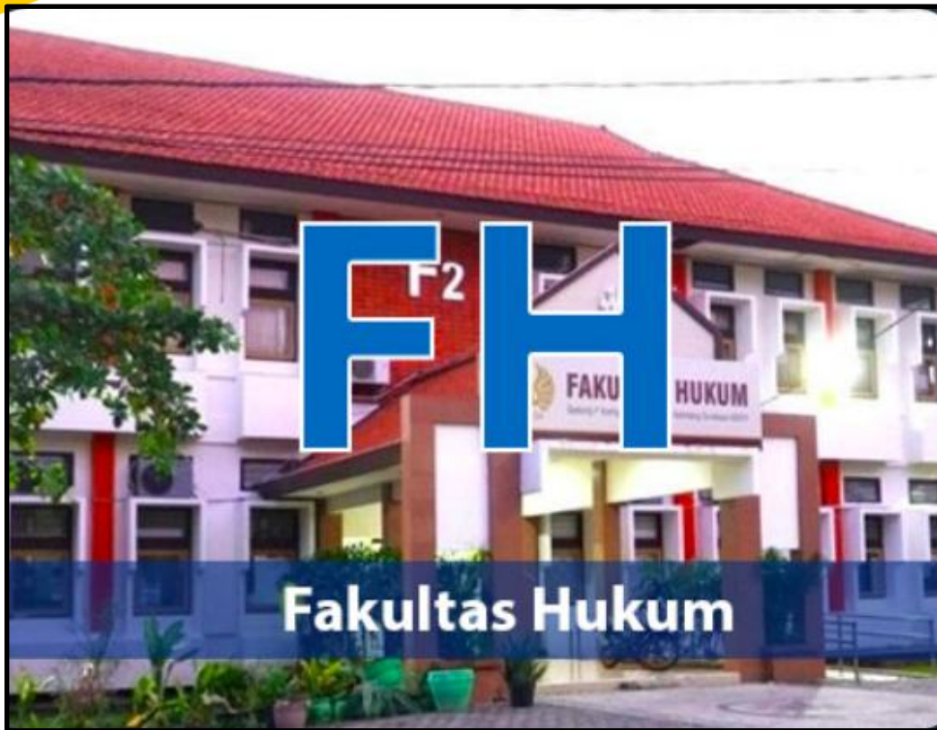
Picture 1. Front View Law Faculty