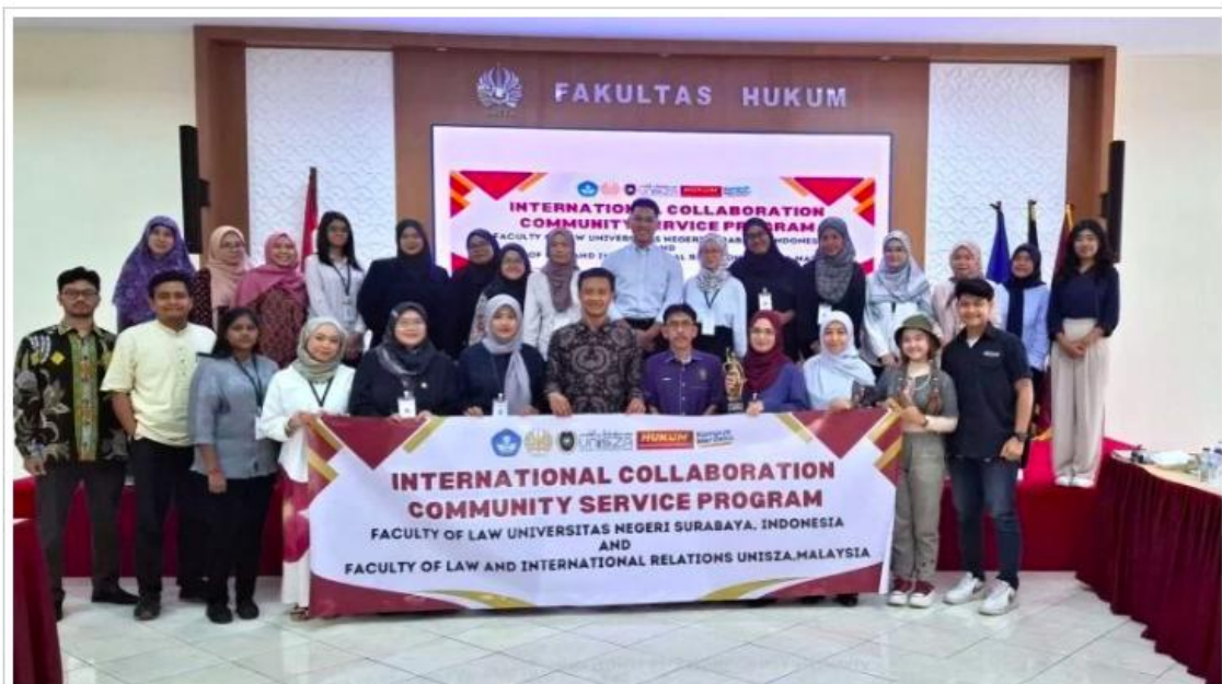
Tim International Collaboration Community Service Program FH UNESA dan FUHA UniSZA Malaysia di FH UNESA Kampus 1 Ketintang< Surabaya.

📅 10 Oktober 2024 - kategori Pengabdian 👁 525 Views 👤 Redaksi