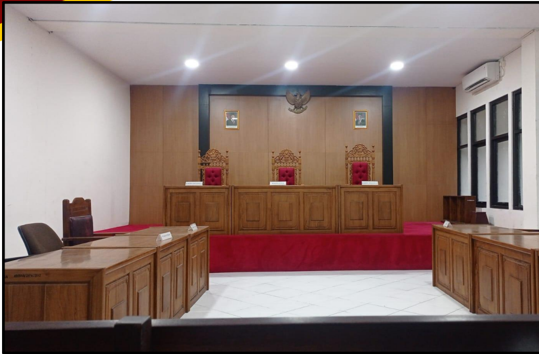
Picture 3. Moot Court Lab