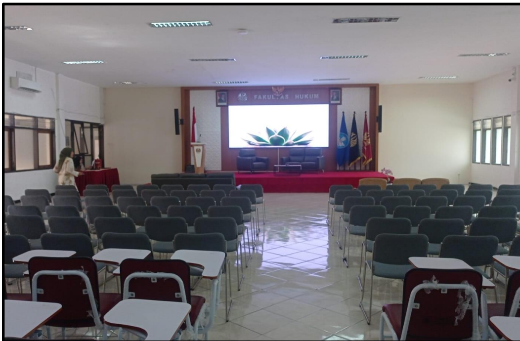
Picture 4. Auditorium