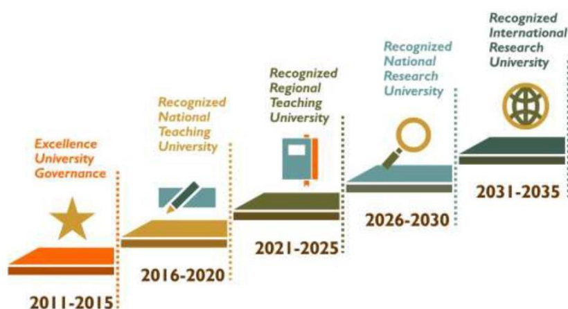
Figure 2 Vision, scope, stages, and attainment time of milestone of Universitas Negeri Surabaya

Vision, scope, stages, and timeline of milestones of Universitas Negeri Surabaya are seen in Figure 2.